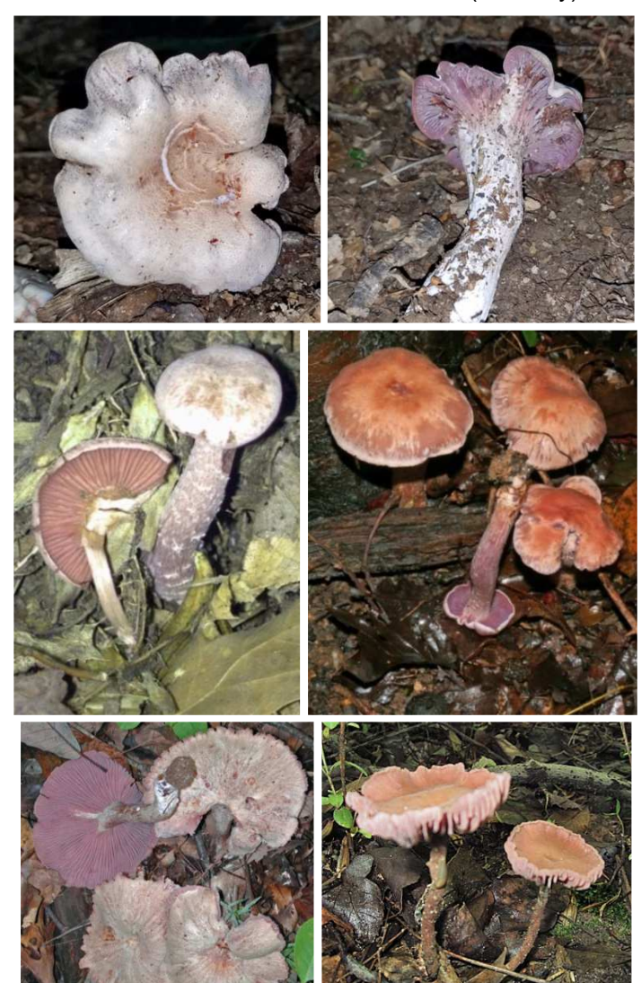
TOP: Savage Park, 9/7/2020, J. Solem. GILLS, and STALK: Savage Park, 9/7/2020, J. Solem. GILLS, CAP and STALK: Long Corner, PRSP, 8/7/2009, J. Solem. CAPS, GILLS, and STALK (old): Hammond Schools, 9/9/2011, J. Solem. GILLS, CAP and STALK (old): Western Regional Park, 9/25/2017, J. Solem. SIDE: Rockburn Branch Park, 6/1/2018, J. Solem.