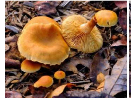
Kuehneromyces mutabilis (Schaeffer) Singer & A.J.Smith