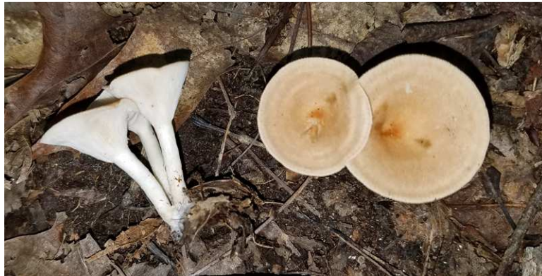
OVERALL: Pigtail, 8/20/2020, J. Solem. GILLS and STALKS, TOPS: Pigtail, 8/20/2020, J. Solem.