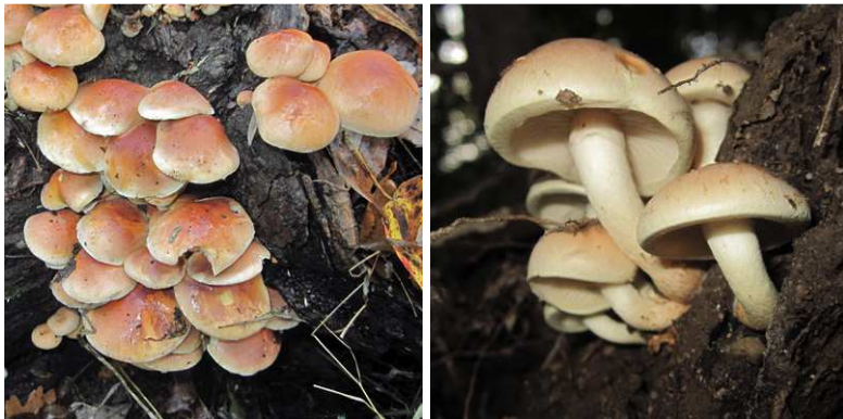
GILLS and TOP: Wincopin, 10/5/2009, J. Solem . OVERALL: School Master Place, 10/29/2015, J. Solem . SIDE: Morning Choice Trail, PVSP, 10/2/2015, J. Solem .