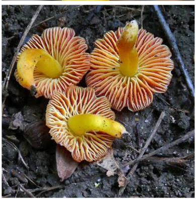
OVERALL: Morning Choice Trail, PVSP, 12/9/2015, J. Solem. GILLS and STALK: Morning Choice Trail, PVSP, 12/9/2015, B. Ott. OVERALL: Morning Choice Trail, PVSP, 10/18/2011, J. Solem. GILLS and STALK: Morning Choice Trail, PVSP, 10/18/2011, J. Solem.