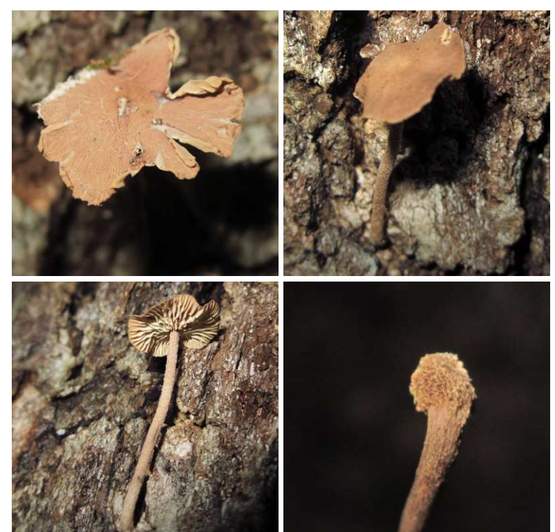
TOP: Morning Choice Trail, PVSP, 8/4/2016, J. Solem. SIDE: Morning Choice Trail, PVSP, 8/4/2016, J. Solem. GILLS and STALK: Morning Choice Trail, PVSP, 8/4/2016, J. Solem. BASE OF STALK: Morning Choice Trail, PVSP, 8/4/2016, J. Solem.