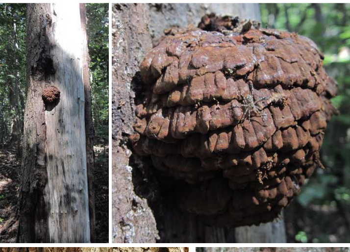
Sweet Knot Globifomes graveolens (Schweinitz) Murrill