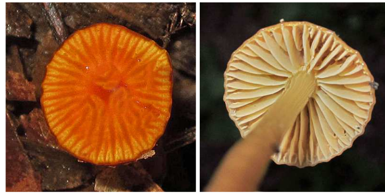
TOPS: Manor Woods E.S., 8/11/2013, GILLS and STALK: Manor Woods E.S., 8/11/2013, SIDE: Gorman Stream Valley NRA, 7/29/2018, SIDE: Manor Woods E.S., 8/11/2013, TOP: Wincopin Trail, 8/8/2018, GILLS and STALK: Gorman Stream Valley NRA, 6/9/2018