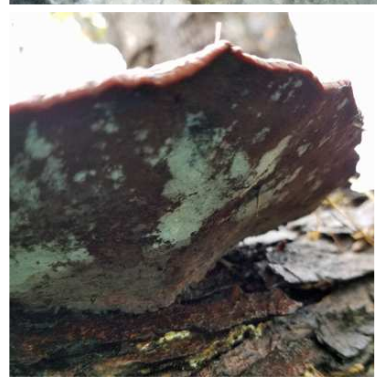
OVERALL: Oakland Mills Road, Guilford,4/26/2020, S. Muller. OVERALL: Tech Drive, Elkridge, 10/5/2013, J. Wilkinson. PORES: Oakland Mills Road, Guilford,4/26/2020, S. Muller.