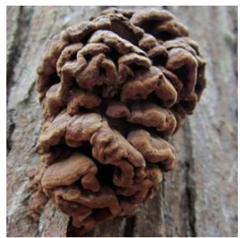
OVERALL (on trunk): Savage Park, 9/30/2014, CLOSEUP Savage Park, 9/30/2014, OVERALL: Centennial Park, 12/12/2019, OVERALL (old; two views): Henryton, 1/15/2013