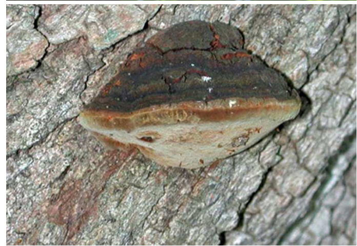
OVERALL: Cascade Trail, 6/4/2010, R. Solem. PORES: Cascade Trail, 6/4/2010, R. Solem. OVERALL: Browns Bridge, 8/5/2011, J. Solem.