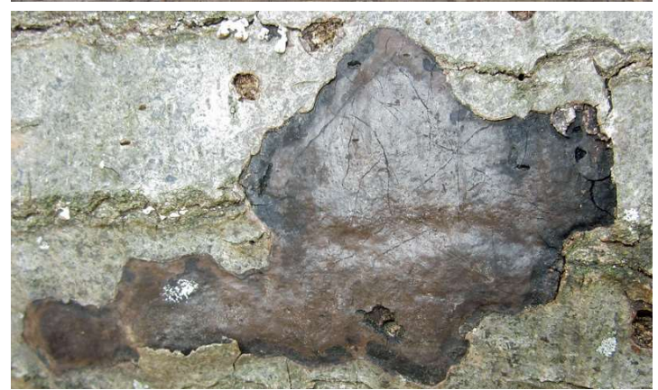
OVERALL (mature): Wincopin Trail, 12/12/2015, J. Solem. OVERALL (mature): Wincopin Trail, 12/12/2015, J. Solem. OVERALL (mature): Murray Hill, 4/15/2016, J. Solem.