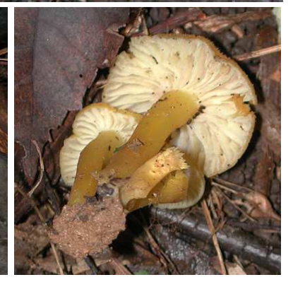
TOPS: Robinson Nature Center, 9/12/2011, CAP and STALKS: Robinson Nature Center, 9/12/2011, STALKS and GILLS: Robinson Nature Center, 9/12/2011