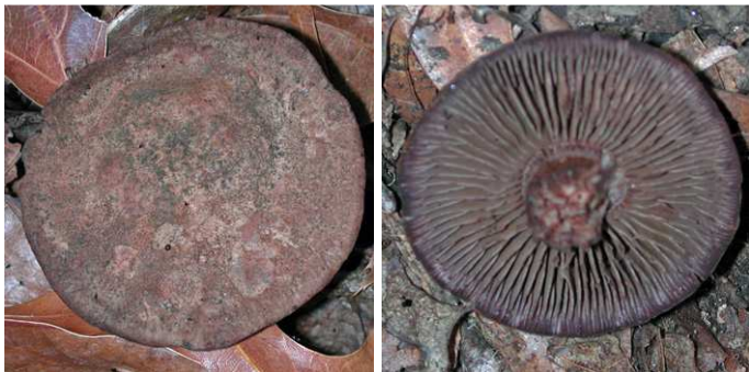
OVERALL: Pigtail, 10/23/2009, J. Solem. TOP: Pigtail, 10/23/2009, J. Solem. GILLS: Pigtail, 10/23/2009, J. Solem.