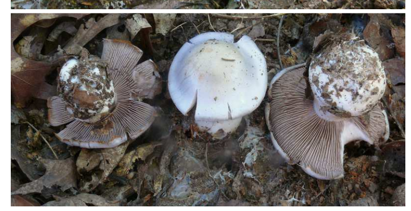
SIDE: Pigtail, 10/6/2009, R. Solem. GILLS and TOP: Pigtail, 10/6/2009, R. Solem.