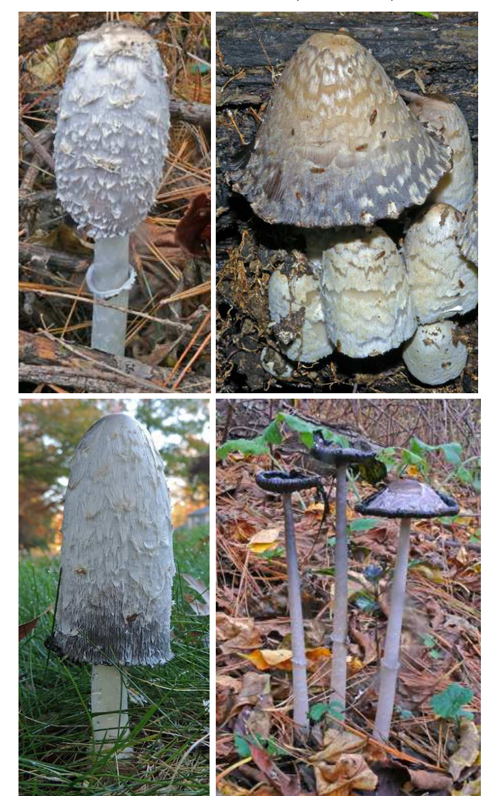
SIDE and RING (young): River Hill,10/30/2009, R. Solem. OVERALL: Mt Pleasant, 6/8/2009, B. Ott. SIDE (mature): Beaverbrook, 10/25/2014, R. Orr. DELIQUESCING CAPS: River Hill,10/30/2009, R. Solem.