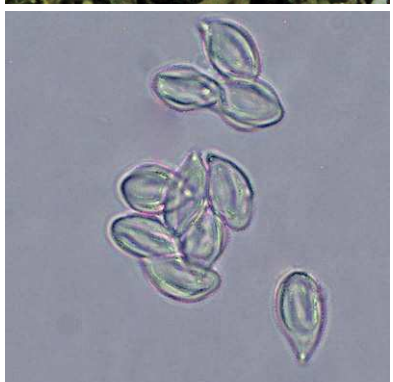
TOP: Big Branch, 8/19/2011, R. Solem. GILLS and STALK: Big Branch, 8/19/2011, R. Solem. OVERALL: Long Corner, PRST, 8/7/2009, R. Solem. SIDE: Long Corner, PRST, 8/7/2009, R. Solem. SPORES (9.0-10.6 x 5.5-5.9 µm): Big Branch, 8/19/2011, R. Solem.