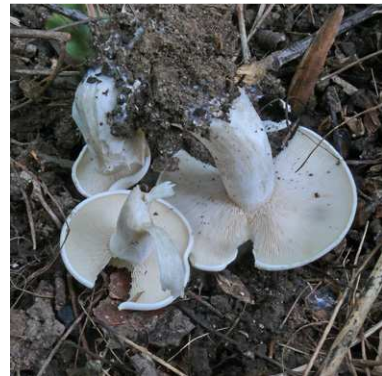
OVERALL: Rockburn Branch Park, 9/22/2009, SIDE: Rockburn Branch Park, 9/22/2009, GILLS and STALKS: Rockburn Branch Park, 9/22/2009