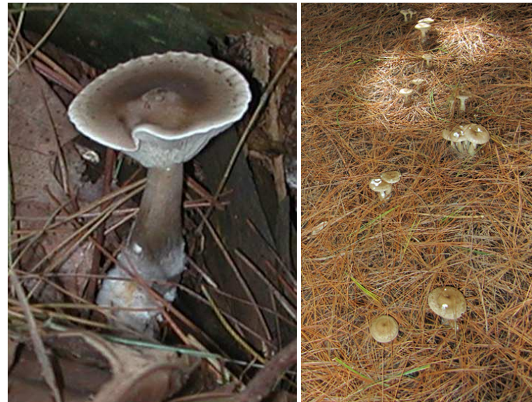
OVERALL: Rockburn Branch Park,10/18/2010, CAP, STALK and BASE: Scott's Cove, 10/6/2008, FAIRY RING: Annapolis Rock, PRSP,10/11/2015