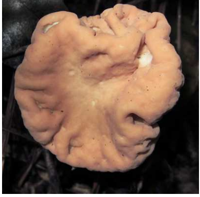
OVERALL: Gorman Stream Valley NRA, 10/29/2018, OVERALL: Gorman Stream Valley NRA, 10/29/2018, TOP: Gorman Stream Valley NRA, 10/29/2018, TOP: Gorman Stream Valley NRA, 10/29/2018