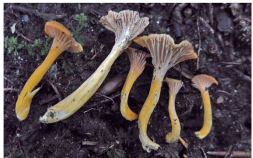
TOPS: High Ridge Park, 8/17/2017, SIDES: High Ridge Park, 8/17/2017, FERTILE SURFACE: High Ridge Park, 8/17/2017, OVERALL: Samantha Way, PVSP, 7/14/2015, FERTILE SURFACE; OVERALL: Samantha Way, PVSP, 7/14/2015