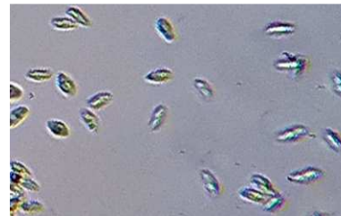
SPORES (6.0-7.0 x 2.4-3.2 µm): Glenelg HS, 7/12/2020, R Solem.

References: https://www.fungusfactfriday.com/229-buglossoporus-quercinus/ , http://fungi.myspecies.info/all-fungi/buglossoporus-quercinus .