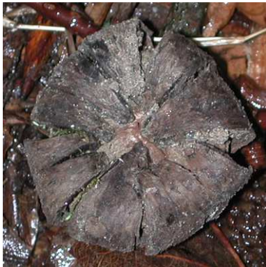
OVERALL: Cascade Trail, 4/13/2011, R. Solem. OVERALL: Cascade Trail, 4/13/2011, R. Solem OVERALL: Cascade Trail, 4/13/2011, J. Solem.