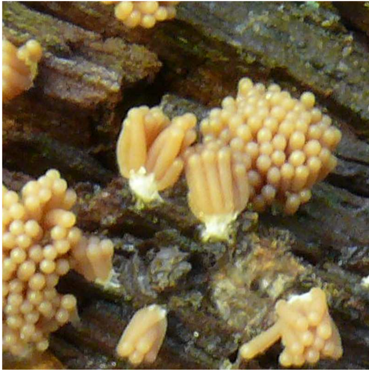
CLOSEUP: Pigtail, 8/29/2010, R. Solem.