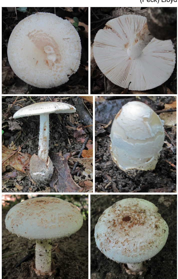
TOP: Schooley Mill Park, 6/19/2012, GILLS: Schooley Mill Park, 6/19/2012, OVERALL: Schooley Mill Park, 6/19/2012, BUTTON: Schooley Mill Park, 6/19/2012, OVERALL: Middle Patuxent Environmental Area, 7/3/2013, TOP: Middle Patuxent Environmental Area, 7/3/2013