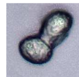
SPORES (8.5-10.7 X 7.2-8.8 μm): Big Branch 8/5/2009, R. Solem. Specimen not photographed.

References: Bar 241. BBF 67, 274. Kuo. Lae 150. Lin 551, 123, 124, 672. M&M 29. Roo 62. Rus 67, 24.