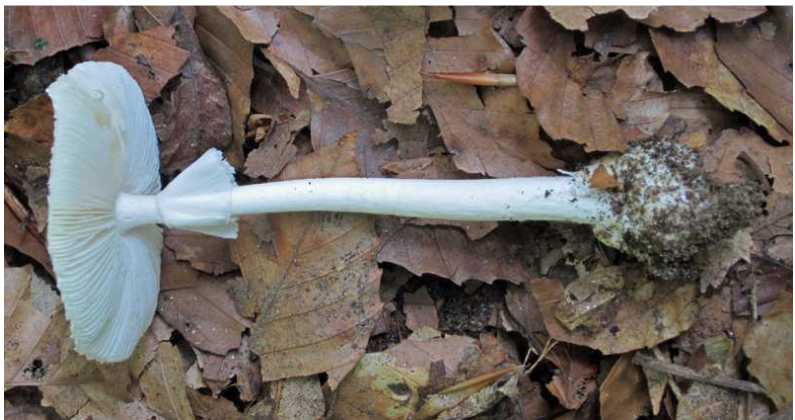
GILLS, RING, STALK, VOLVA: Wincopin Trail, 8/21/2011, R. Solem. TOP: Cedar Lane Park, 9/15/2008, J. Solem. SIDE: Wincopin Trail, 8/21/2011, R. Solem. OVERALL: Wincopin Trail, 6/20/2012, J. Solem.