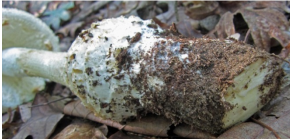
CAP, GILLS, STALK: Gorman Stream Valley NRA, 9/19/2012, J. Solem. SIDE: Nichols Cove, 8/13/2012, J. Solem. OVERALL: Nichols Cove, 8/13/2012, J. Solem. BULB and ROOT (in part): Nichols Cove, 8/13/2012, J. Solem.