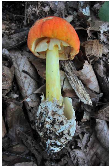
TOP: Wincopin Trail, 8/21/2011, R. Solem.