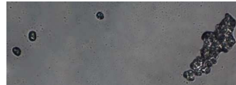
SPORES (7.2-8.5 X 4.0-4.7 μm): Pigtail, 8/17/2009, R. Solem.

References: Bar 238. BBF 63, 273. BBH 48. Bin 15. Bni 27. E&S 125. K&M 92. Lin 534, 136, 139. M&M 34. Phi 31. Roo 54. Stu 12.