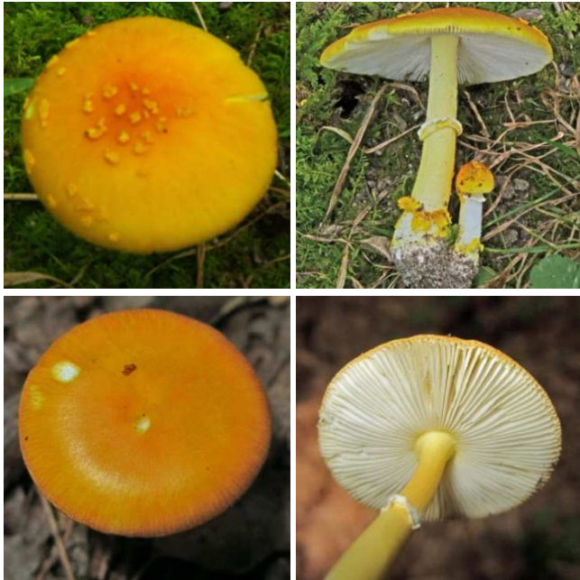
SIDE: Pigtail, 8/17/2009, TOP: Pigtail, 8/17/2009, GILLS, RING, and VOLVA: Pigtail, 8/17/2009, TOP: Gorman Stream Valley NRA, 7/29/2018, GILLS and RING: Gorman Stream Valley NRA, 7/29/2018