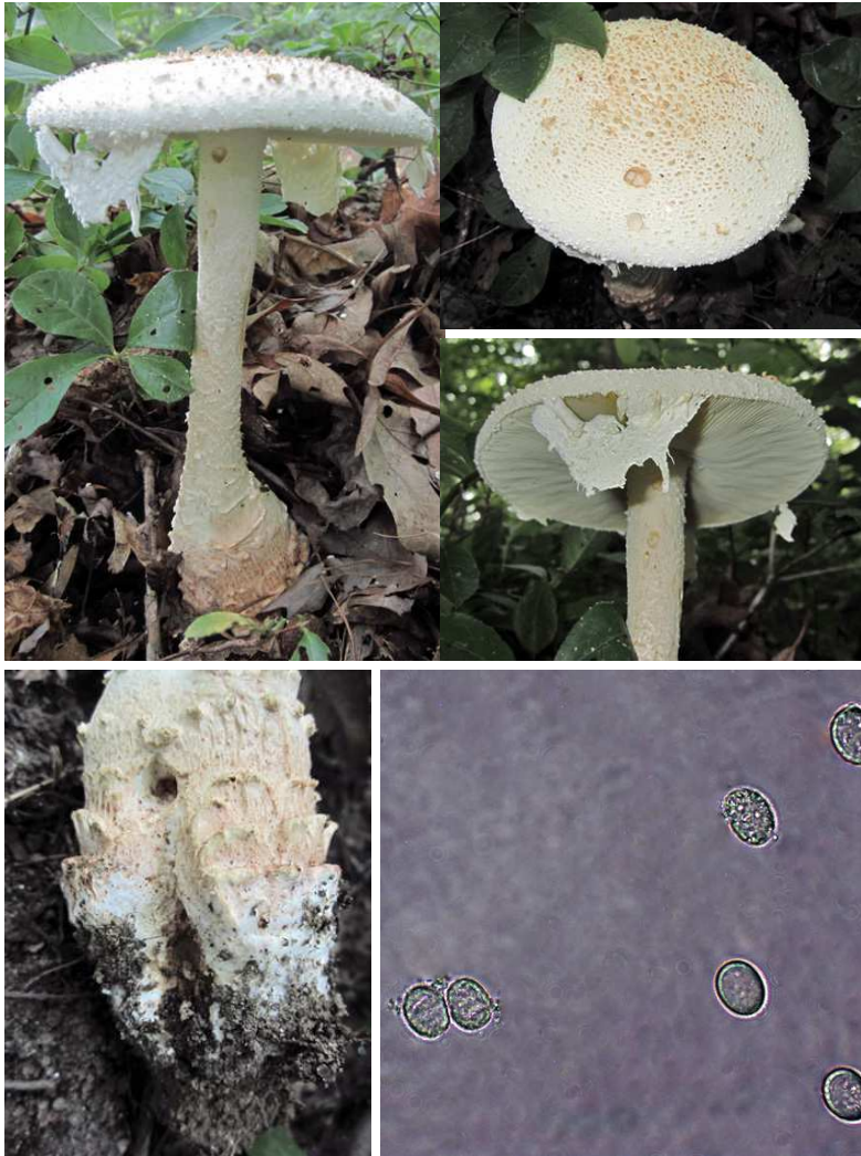
OVERALL: Rocky Gorge, 7/18/2014, TOP: Rocky Gorge, 7/18/2014, STALK, VEIL, and GILLS: Rocky Gorge, 7/18/2014, ROOTED BULB: Rocky Gorge, 7/18/2014, SPORES (8.6 – 9.8 X 6.7 – 7.5 µm): Rocky Gorge, 7/18/2014