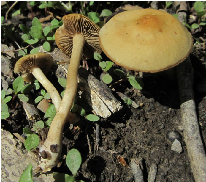
TOP: Schooley Mill Park, 4/21/2013, CAPS, GILLS STALKS: Schooley Mill Park, 4/21/2013