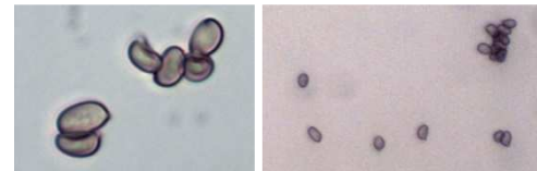
SPORES (4.5-5.3 X 3.3-3.6 µm): Sykesville/River Road, 9/26/2011, R. Solem .

References: Bar 194. BBF 53, 271. Bni 326. BRBD 102FV. E&S 120. K&M 82. Kuo. M&M 278. Phi 225. Rog. W&L 403.