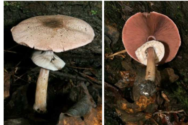
PARTIAL VEIL, RING and TOP: Rocky Gorge, 9/19/2009, R. Solem . TOP: Daniels Road, PVSP, 7/20/2011, J. Solem . STALK and GILLS w/ PARTIAL VEIL: Wincopin Trail, 7/18/2010, J. Solem . SIDE (showing ring): Sykesville/River Road, PVSP, 9/26/2011, R. Solem . BOTTOM (showing ring): Sykesville/River Road, PVSP, 9/26/2011, R. Solem .