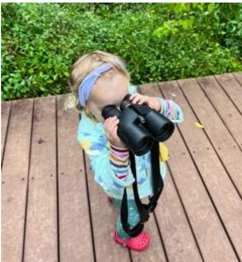
Mom's 8 x 42 bins

Can kids handle “adult” binoculars? Charlotte P. Age 2 ½ (photos used w/Kate Plough permission)